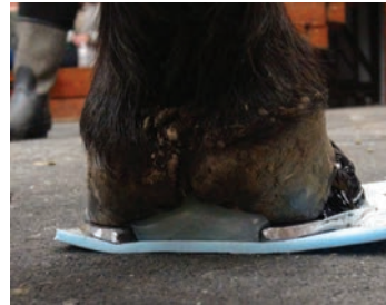
March 2021 - Vettec Equi-Pak applied to provide support and protection.