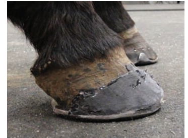
March 2021 - Vettec Adhere dressed before final nails are driven.