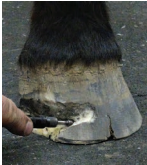
March 2021 - using Dremel tool to get final clean up at juncture of wall and laminae.