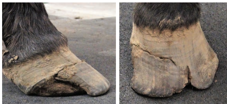
March 2021 - missing wall and lateral Toe quarter undermined.