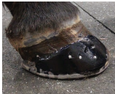
March 2021 - after clinching, note the ledge of material at top to help with bond.