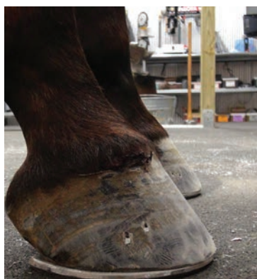
July 2020 - shod with Diamond Tracker Shoe.