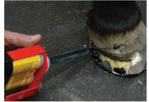
March 2021 - applying first layer of Adhere.