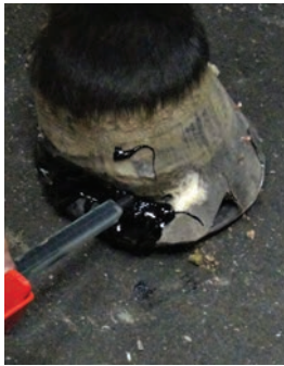
March 2021 - application of second and third layer.