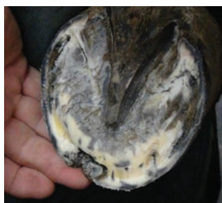
July 2020 - sole area. Note indications of abscess in toe area.