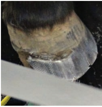
March 2021 - rasping outer wall to get indication of true shape.