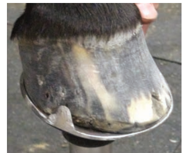
In June 2021 reset, very little patch needed to fill void in toe quarter.