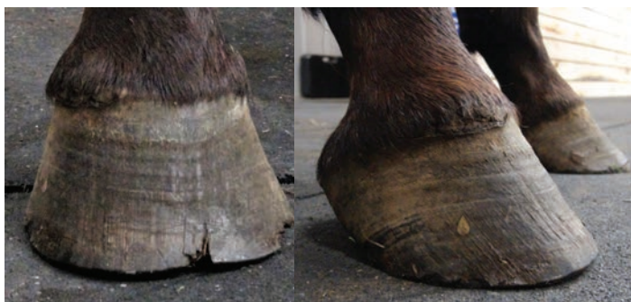
July 2020 - Annabelle before trim.