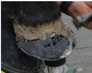
March 2021 - nails driven through material, ready to clinch.