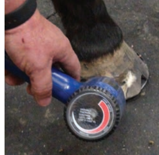
March 2021 - using heat gun to dry area to be patched after shoe has been applied.