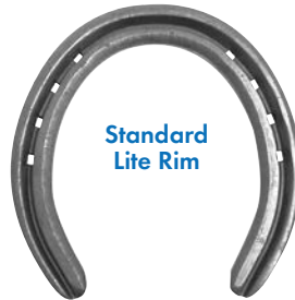
Standard Lite Rim

The Kerckhaert Standard Rim series has been replaced with the Standard Lite Rim. The Standard Lite Rim 0, 1 and 2 are now available in the new dimension; sizes 000 and 00 will be available soon. Standard Lite Rim size 2 is a new size for the range. The chart below shows how the dimensions of the shoes have changed. The change is minimal, and we hope the combination of the two styles into one will be more efficient for you.