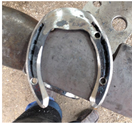
Heels ground to allow them to sink in the surface.