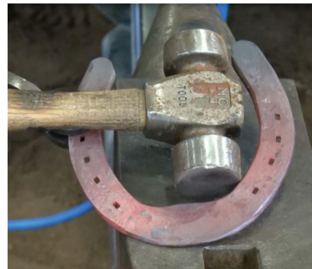
Using an SX-7, you can accomplish a similar result but with less metal you may not get the desired width.