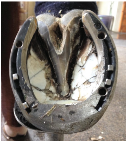
Applied to foot. Note the medial heel is ground slightly narrower.