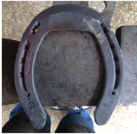
Finish the forging on the face of the anvil.