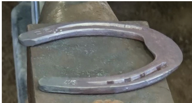
Final forging of the SX-7 on face of anvil.