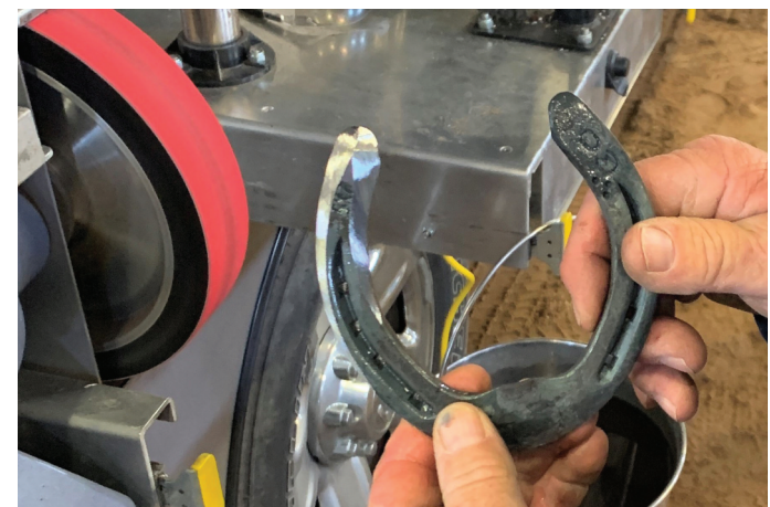
Medial heel ground to allow for sinking in the surface.