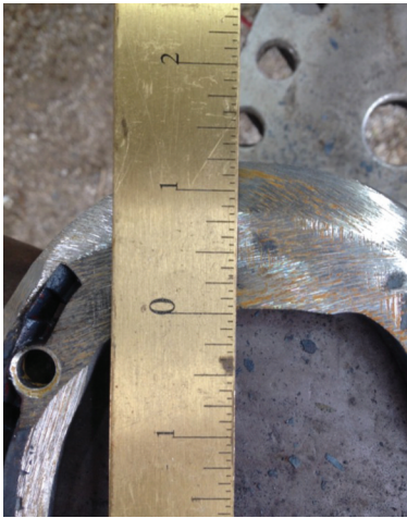
Check to see if you forged to the desired width.