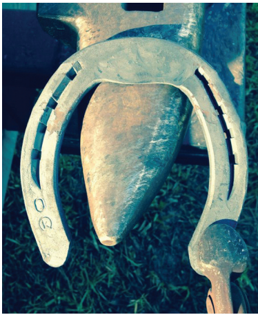
Kerckhaert DF Select hind shoe with ground surface up. Start forging the inside web toward you.