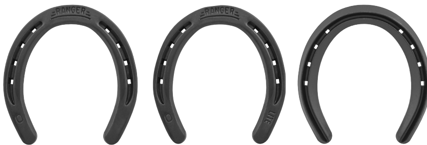
Ranger Plain (9mm) Sizes - 00, 0, 1, 2 & 3

The Ranger Horseshoe Line by Kerckhaert has been designed for everyday use in both work and pleasure. With a higher grade of steel and v-crease, these shoes provide the perfect solution for farriers who want the best results at the best price.