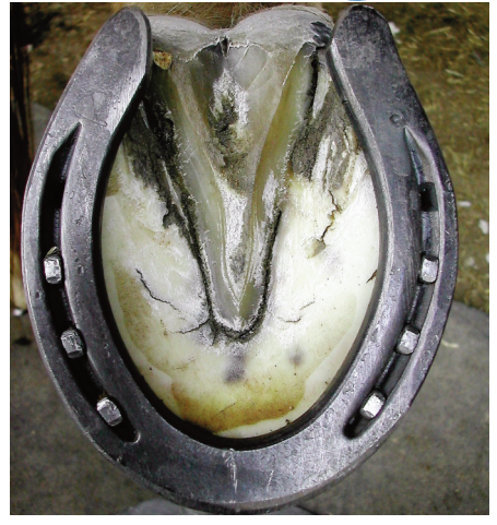
Lateral heel fit a bit wider for this horse, medial tighter to avoid interference potential.