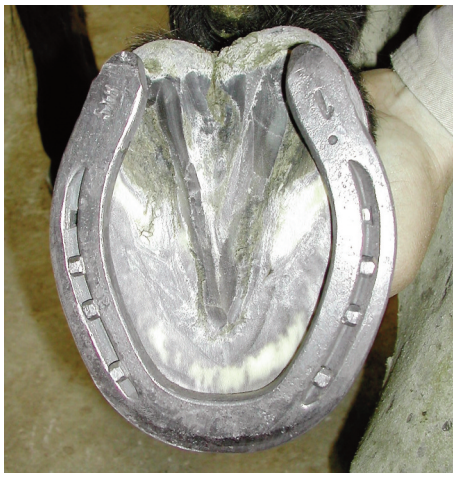
Bottom of foot, SX-8 unclipped shoe.