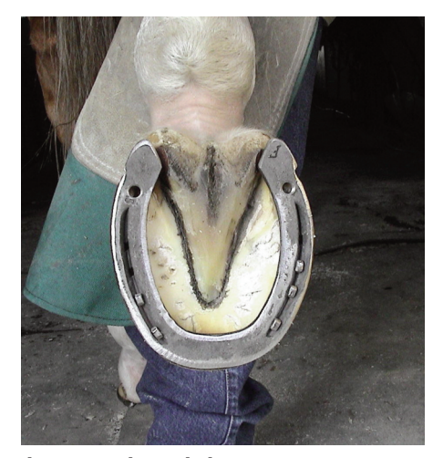
This SX-8 clipped shoe on a jumper is a slightly different look but can be considered an extended heel.